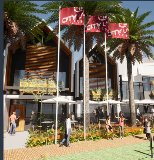
City Lodge: V&A Waterfront

Client: NV Properties Description: Additions & alterations to existing facility. Completion: 2024 Scope: Structural and Civil Engineering