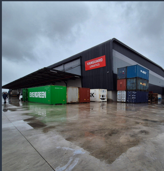
Clairwood Logistics Park: Pocket 5B

Client: Fortress Description: New warehouse. Size: 12 000 m 2 Completion: 2024 Scope: Structural and Civil Engineering