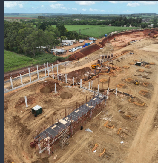
Prince Buthelezi Mall

Client: Benav Properties Description: New Boxer store and line shops. Size: 3 000 m 2 Completion: 2025 Scope: Structural and Civil Engineering