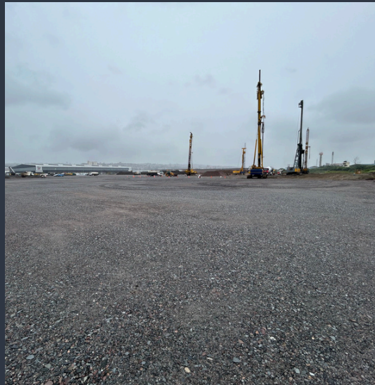
Clairwood Logistics Park LP6

Client: Fortress Description: New warehouse and offices. Size: 32 000 m 2 Completion: 2026 Scope: Structural and Civil Engineering