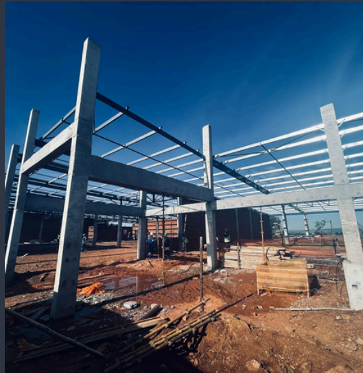
Boxer Store Ennerdale

Client: Benav Properties Description: New Boxer store and line shops. Size: 3 000 m 2 Completion: 2025 Scope: Structural and Civil Engineering