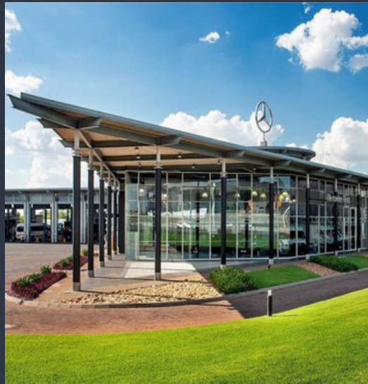
Sandown CV Centurion

Client: DTSA Description: Additions & alterations to existing commercial vehicles facility. Completion: 2024 Scope: Structural and Civil Engineering